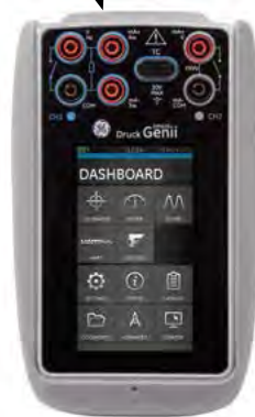
DPI620G Multifunction Calibrator and Communicator