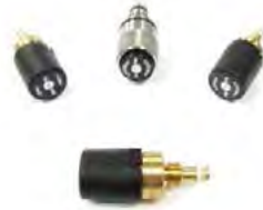
Relief Valve Table