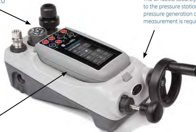
PV62XG Pressure Station. The DPI620G securely attaches to the pressure stations when pressure generation and measurement is required