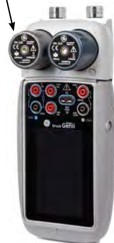
MC620G Pressure Module Carrier. Securely attaches to the DPI620G when pressure measurement is required